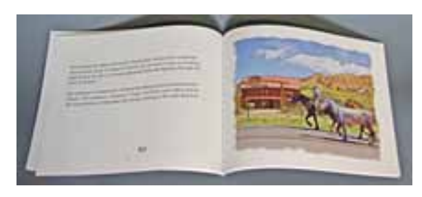
8 1/2 x 11, Perfect Bound, 40 page children's book with 17 color illustration.

This book is about art, imagination, creativity and vision. It also is a snap shot of a year in a very small Western Town "Where cowboys work and play". Dubois, Wyoming is nestled in the Wind River Valley a Gateway to Yellowstone and Teton National Park.